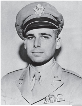
Photo of pilot Captain Gene Roddenberry.