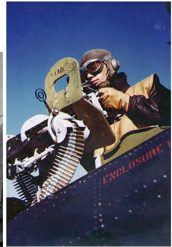
On your left are Dauntless dive bombers, U.S. aircraft that battled in the Pacific. Above is a naval SBD gunner on the USS Independence , an aircraft carrier.