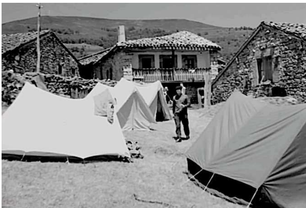
A photo of some of the people who went to Garabandal, and slept in make shift tents, as best they could.